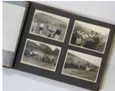
A Student's Photo Album, 1920s

The collection currently holds over 200 meters of archived materials. It includes political and educational writings by and about Kurt Hahn, as well as letters, memorabilia, speeches, paintings and sculptures, an abundance of photographs and photo albums made by students, as well as audiovisual media (videos, DVDs, and films). In addition, it holds a considerable amount of documentation about Schule Schloss Salem, including the estates of Salem teachers and information about other organizations which have followed Kurt Hahn's educational ideas. Furthermore, the archive maintains a library of pedagogical texts, research works and writings by former students.