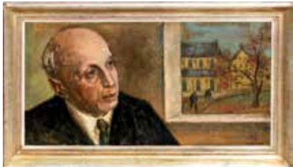
Portrait of Kurt Hahn, 1967

The Kurt Hahn Archive collects and preserves materials related to Kurt Hahn, a German educator and co-founder of Schule Schloss Salem. The archive is an important contact point for all questions regarding Hahn as a person of historical interest as well as the school's history, and the historical development of reform pedagogy in Germany. It holds materials dating back to 1920 which offer insight into the lives and influence of many important figures who have contributed to the school's development since its founding.