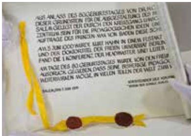
Official Document upon Kurt Hahn's 80th Birthday, 1966

Our archived materials can be used by any interested individual upon application. Please request access by telephone or email.