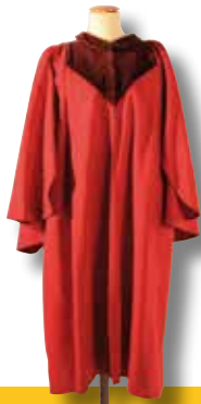
Photo top: Films of Student Life at Salem Photo right: Marina Ewald's Cape

"Any person with a justifiable interest has the right to use archived materials in accordance with applicable guidelines and after expiration of legal embargos, in as far as statutory provisions or agreements with current or former owners of the archived material do not specify otherwise." (§ 6 I LArchG)